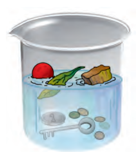
Fig. 2.6 Some objects float in water while others sink in it

drops of honey that you let fall into a glass of water. What happens to all of these?