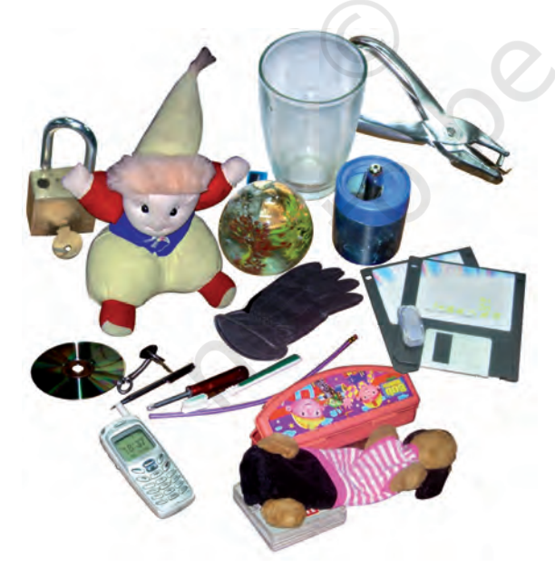
Fig. 2.1 Objects around us

Look around and identify objects that are round in shape. Our list may include a rubber ball, a football and a glass marble. If we include objects that are nearly round, our list could also include objects like apples, oranges, and an earthen pitcher ( gharha ).