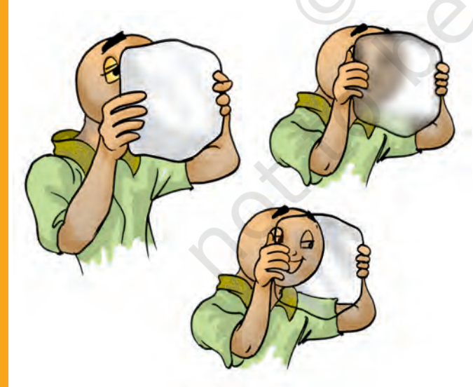
Fig. 2.7 Looking through opaque, transparent or translucent material

You might have played the game of hide and seek. Think of some places where you would like to hide so that you are not seen by others. Why did you choose those places? Would you have tried to