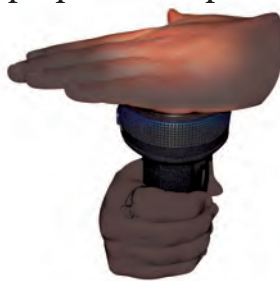
Fig. 2.9 Does torch light pass through your palm?

We can therefore group materials as opaque, transparent and translucent.