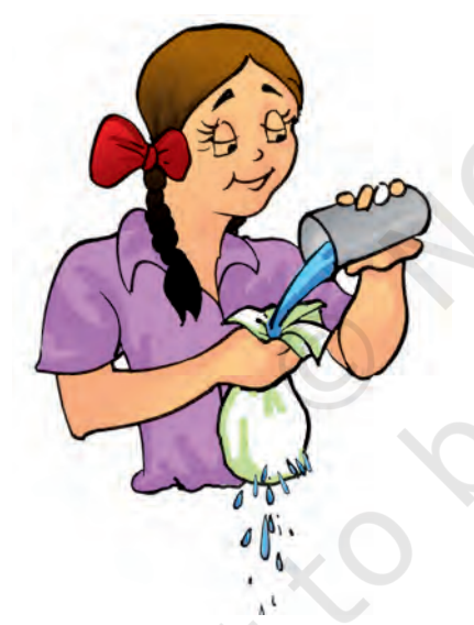
Fig. 2.2 Using a cloth tumbler

We see then, that we choose a material to make an object depending