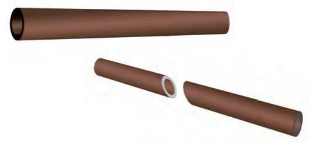
Fig. 2.3 Cutting pieces of materials to see if they have lustre

Do you notice such a shine or lustre in the other materials, cut them anyway as you can? Repeat this in the class with as many materials as possible and make a list of those with and without lustre. Instead of cutting, you can rub the surface of material with sand paper to see if it has lustre.