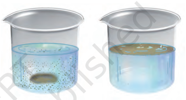
Fig. 2.4 What disappears, what doesn't?

beakers. Fill each one of them about twothirds with water. Add a small amount (spoonful) of sugar to the first glass, salt to the second and similarly, add small amounts of the other substances into the other glasses. Stir the contents of each of them with a spoon. Wait for a few minutes. Observe what happens to the substances added to water (Fig. 2.4). Note your observations as shown in Table 2.3.